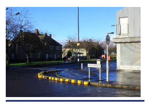
Temporary kerbs creates a tighter turn and helps slow down traffic entering Huntly Crescent.