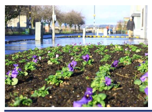
New planting on Raploch Rd at Huntly Crescent.