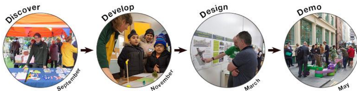
Indicative overview and approximate timeline of the Street Design process

The project team will work collaboratively with residents, businesses and other local organisations to ensure local people are brought into active partnership and share decision making to produce a concept design. The process we use is divided into stages, as shown below.