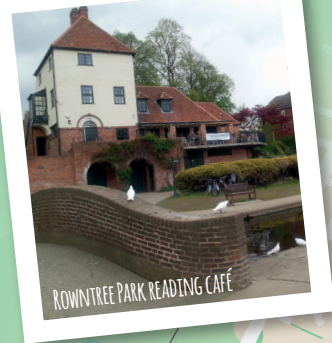
ROWNTREE PARK READING CAFÉ

An alternative is to turn right at the Millennium Bridge, then left onto Bishopthorpe road and rejoin the cycle path at The Chocolate Works.