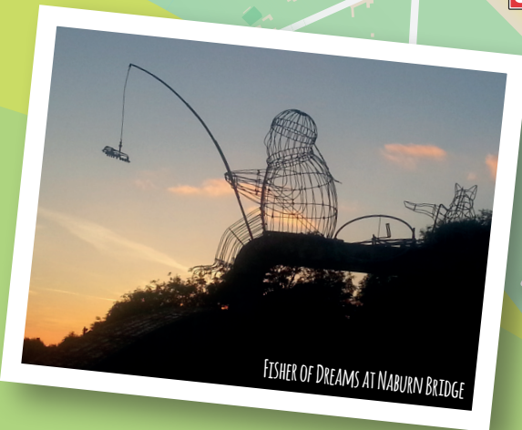
FISHER OF DREAMS AT NABURN BRIDGE