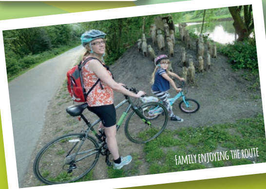
FAMILY ENJOYING THE ROUTE

Take care cycling on the A642 to Woodlesford station/Leventhorpe Vineyard.