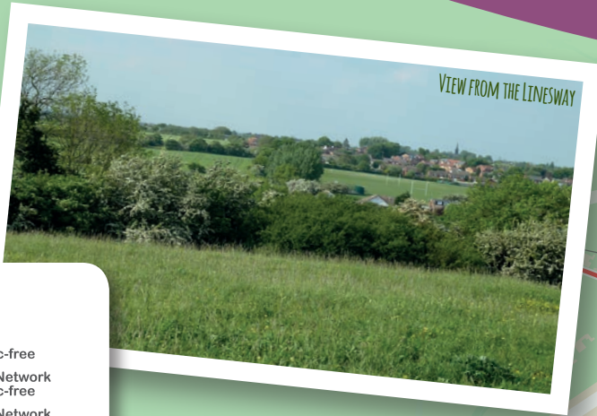
VIEW FROM THE LIMESWAY